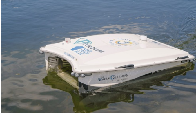
Pixie Drone in action in the Tahoe Keys

Project Fact Sheet Data as of 05/30/2025