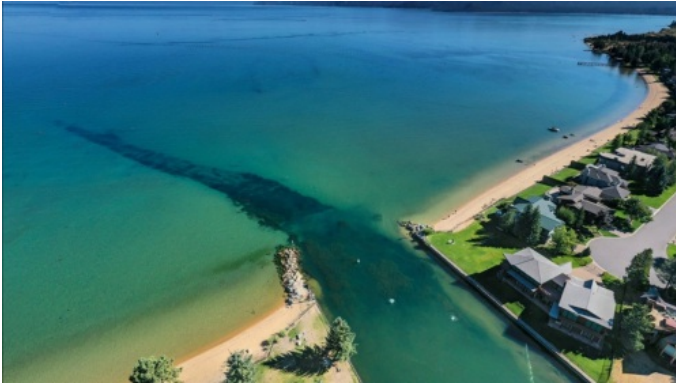
Aerial image of the aquatic invasive weeds in the Tahoe Keys Complex and the East Channel of the Tahoe Keys Marina