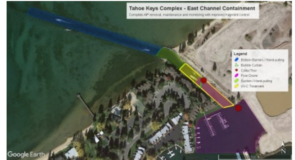
Tahoe Keys Complex East Channel Containment Map

Additional containment tools are integral to Keep Tahoe Blue and free from the threat of aquatic invasive plants. There is currently no active work being completed in the Tahoe Keys Marina to control Aquatic Invasive Plants. The League to Save Lake Tahoe, along with Eco-Clean Solution Inc., is piloting first-time deployment of innovative technologies in the Tahoe Basin to continue work initiated with ECO-Clean Solutions in 2022 to address litter and microplastics with Suntex Marinas. This technology will be used to create a physical barrier between the AIP infestation in the Tahoe Keys Marina and Lake Tahoe. The work was piloted in 2023 with the use of the Pixie Drone technology.