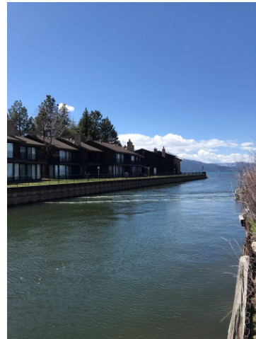
Tahoe Keys East Channel Bubble curtain

Bubble curtains are demonstrating the ability to restrict invasive aquatic plant fragment spread. A bubble curtain system is being installed in the East Channel of the Tahoe Keys to prevent plant fragments from leaving the East Channel and spreading to other areas of Lake Tahoe.