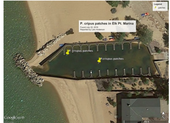
Curlyleaf pondweed detections at Elk Point Marina, Zephyr Cove, NV, 2016