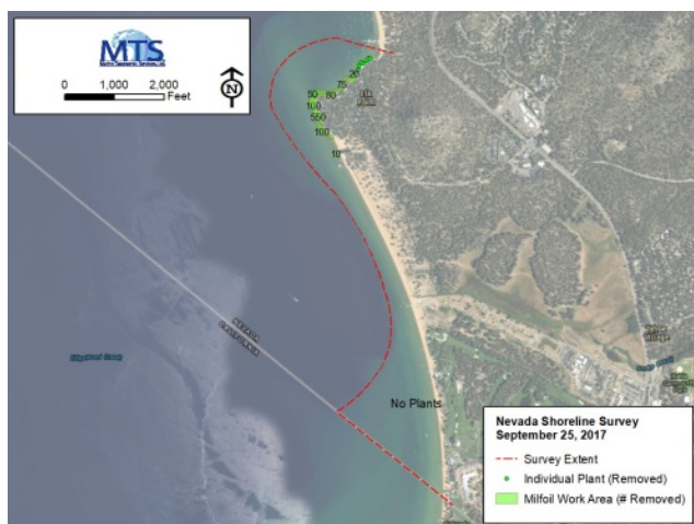
Early Detection and Rapid Response survey and removal of Eurasian watermilfoil July-September 2017, Glenbrook to Round Hill, NV. Note all detections north of the Marina