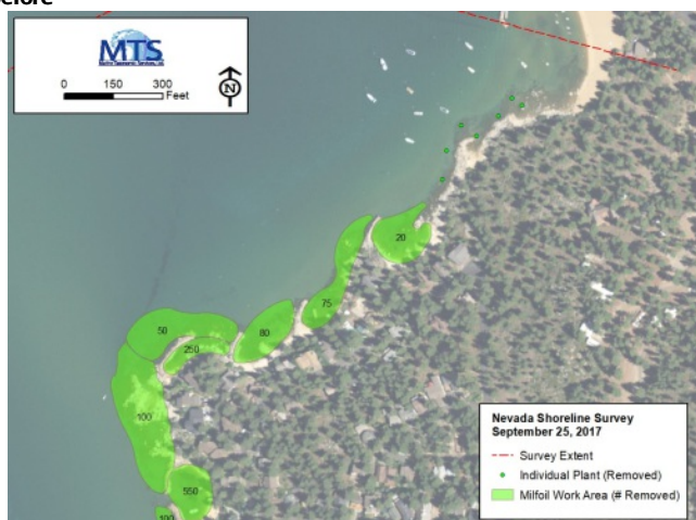
Enlarged view of infestations removed north of Elk Point Marina, July-September 2017, Glenbrook to Round Hill, NV.