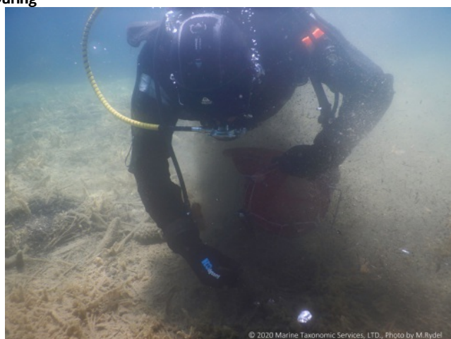
Diver hand-removing newly rooted aquatic invasive plants following treatment, Elk Point Marina, Zephyr Cove, NV, April 2020.