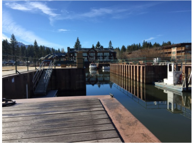
View of Ski Run Marina facing shore (Riva Grill), February 2015

Project Fact Sheet Data as of 05/17/2024