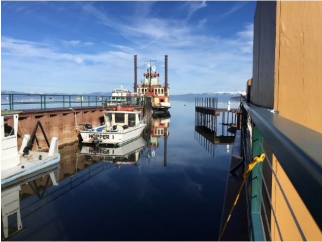
Ski Run Marina facing Lake Tahoe, February 2015