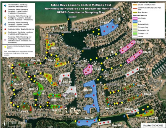
Tahoe Keys CMT Test sites and monitoring locations