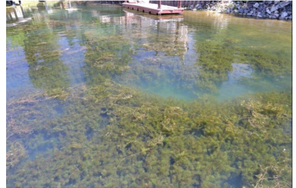
Tahoe Keys Lagoons infested with Eurasian Watermilfoil

The Control Methods Test was approved by TRPA and Lahontan in January 2022, and implementation of the full test- ultraviolet light, aquatic herbicides and other non-herbicidal methods- began in May of 2022. In addition to the test treatment methods, extensive monitoring is being conducted to follow herbicide degradation, water quality conditions, and efficacy of treatment methods.