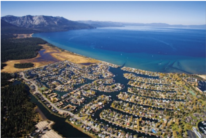
Tahoe Keys Treatment and Monitoring locations