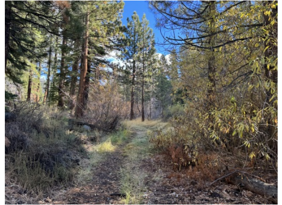
road in SEZ to access sewerline

Between Terrace View and N. Benjamin Road, there is an export sewer line under a branch of Burke Creek that will be relocated out of the stream zone as part of its life span replacement. This project proposes to restore the SEZ that has been impaired by the dirt sewer line access road and trails.