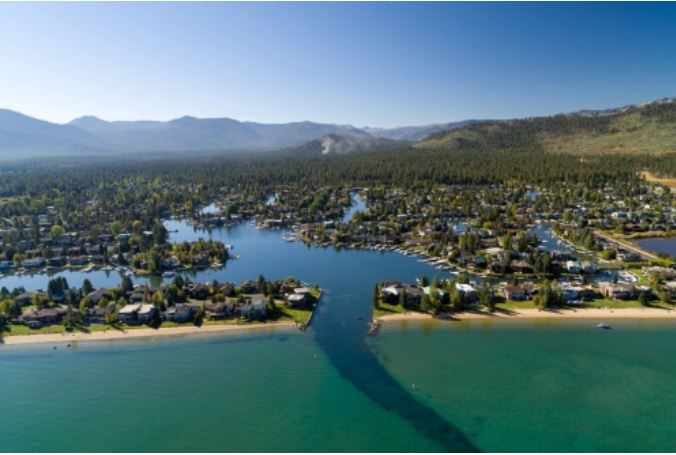
Tahoe Keys homeowners have 11 miles of waterways "lagoons" in their backyard.

Project Fact Sheet Data as of 04/25/2025