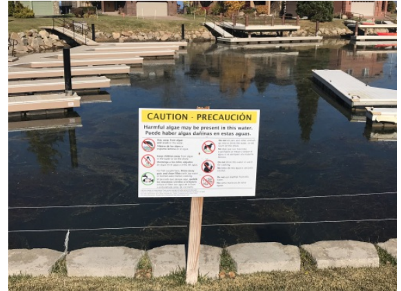
Harmful algae blooms (HABs) are occurring more frequently in the Tahoe Keys lagoons.