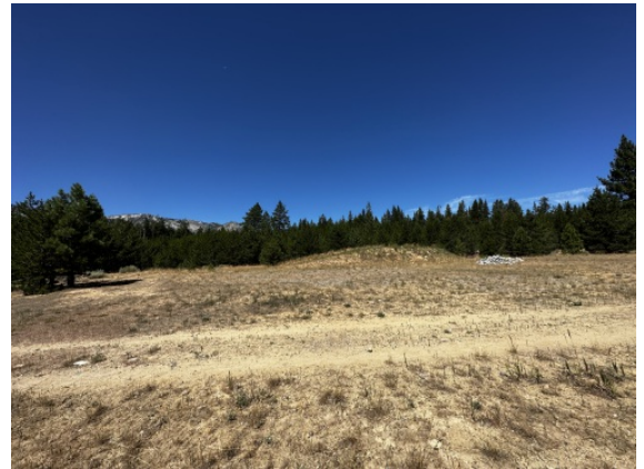
Before photo of project area

California Department of Parks and Recreation is in the initial stage of designing a wetland enhancement project in the old quarry pit and pile near Dry Meadow in Washoe Meadows State Park. The site currently holds water until early summer and has established wetland vegetation - design goals would include expanding wetland habitat by lowering surface elevation, removing discarded quarry debris, maximizing wildlife habitat components, and extending surface water longer into the summer months.