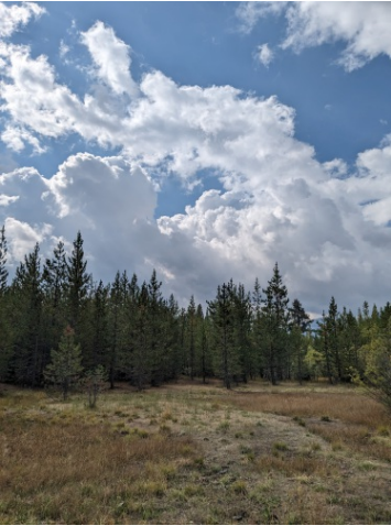
Before view of quarry pit