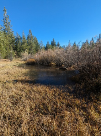
Before photo showing surface water after a rain event and desirable vegetation