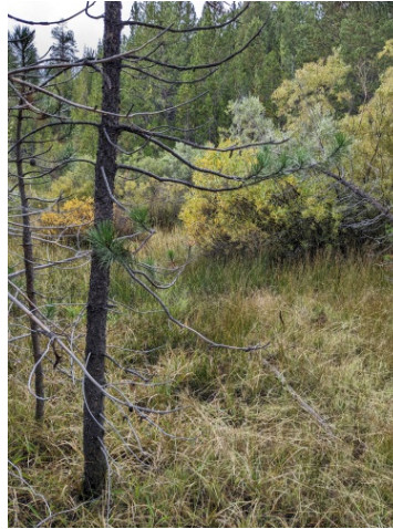
Lodgepole pine encroachment into wetland habitat