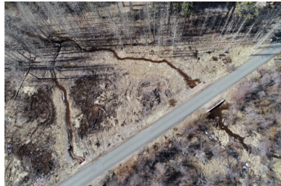
Aerial view of Slaughterhouse Meadow Phase 2

This project restores 0.7 acres of poor functioning fragmented wetland habitat to functional cold-water aquatic and terrestrial wetland habitat and addresses mosquito habitat, water quality, wetland function and diversity through the construction of a beaver analog pond structure. This project results in no net loss of wetland acreage. Total project impacts to a WOUS is 0.70 acres. Total project boundary including upland is two acres. Project results in approx 30 CY of relocated fill, 10 CY of rock fill for erosion protection along roadway and +/- 1,800 for export of pond material. Plan calls for salvage and reuse of all wetland soils and plants.