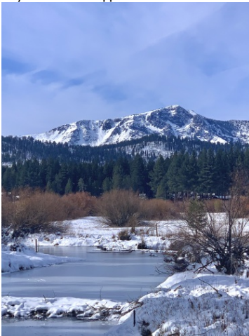
Johnson Meadow and Upper Truckee River with snow