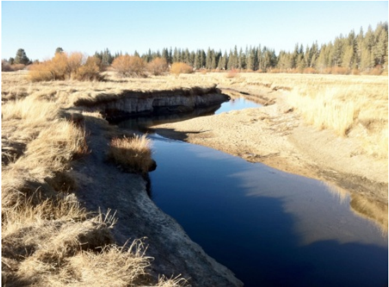
Upper Truckee River in Johnson Meadow

Acquired in April 2018, Johnson Meadow, is a 206+ acre property located in South Lake Tahoe along the Upper Truckee River. Prior to acquisition the property was privately held and served as a dairy and seasonal pasture. Following acquisition Tahoe RCD is engaged in a comprehensive phased restoration project to benefit; wildlife habitat, water quality, fisheries, recreation, vegetation preservation, soil conservation, and public open space. Phase 1 (Complete): Preliminary restoration analysis, planning, and design to a 30%. Phase 2: (Current Phase): Environmental Analysis and design to final design and permitting Phase 3: Implementation and construct