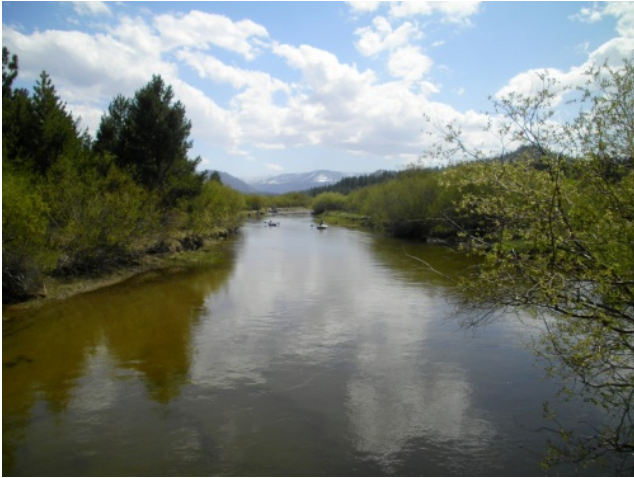
Kayakers on the Upper Truckee