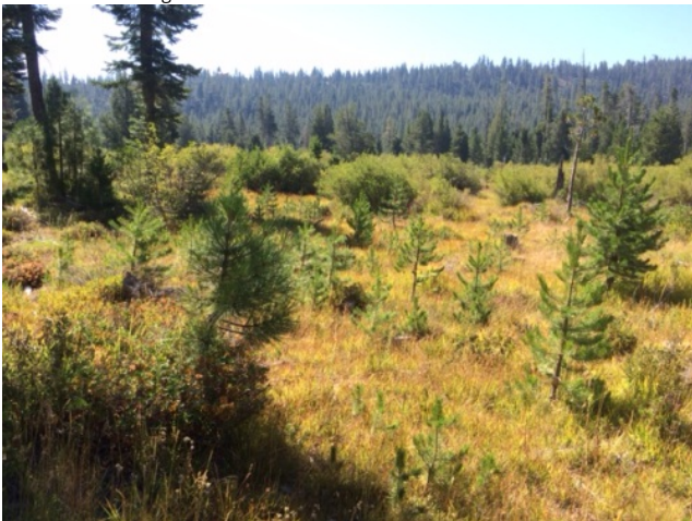
Pre-existing conditions in Meeks Meadow