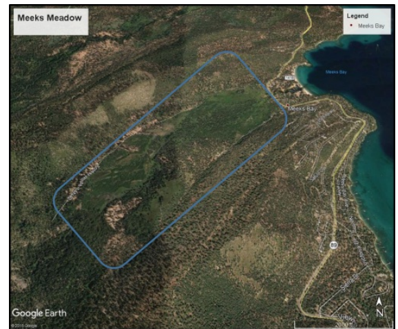
Aerial image of Meeks Meadow