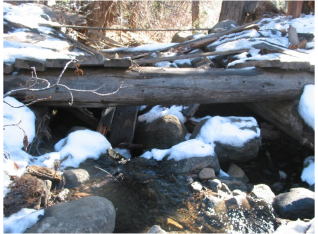
Side view of collapsed bridge.