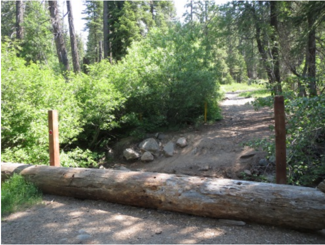
User created bank erosion