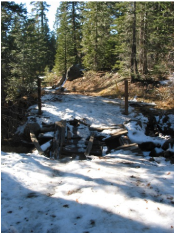
Existing unpaved roadway/trail with collapsed bridge