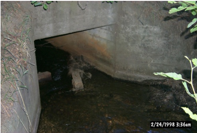
impassable culvert on Incline Creek at Lakeshore Blvd

Project Fact Sheet Data as of 05/18/2024