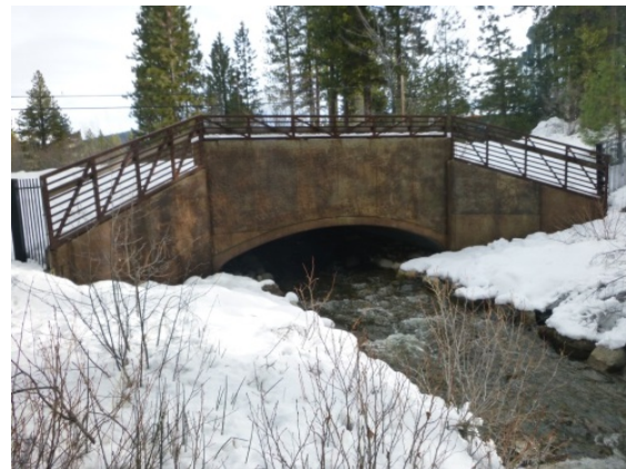
open bottom, fully passable culvert on Incline Creek at Lakeshore Blvd