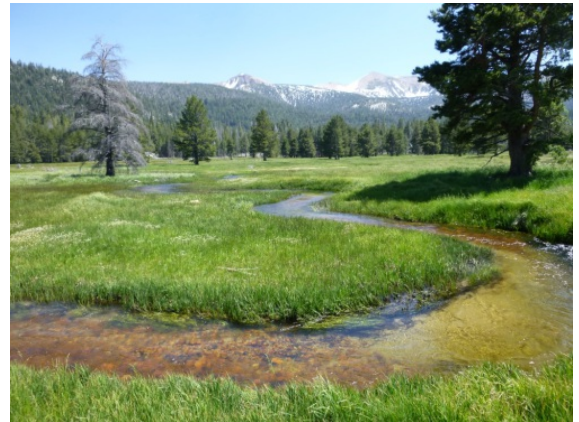
A restored Cold Creek and surrounding meadow

Stream channel and floodplain restoration along Cold Creek in High Meadows. Decommissioned incised channel, constructed new channels and floodplain, installed wood debris structures, and removed lodgepole mortality.