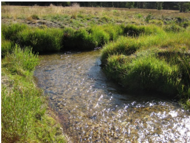
Cold Creek and drying meadow due to past grazing