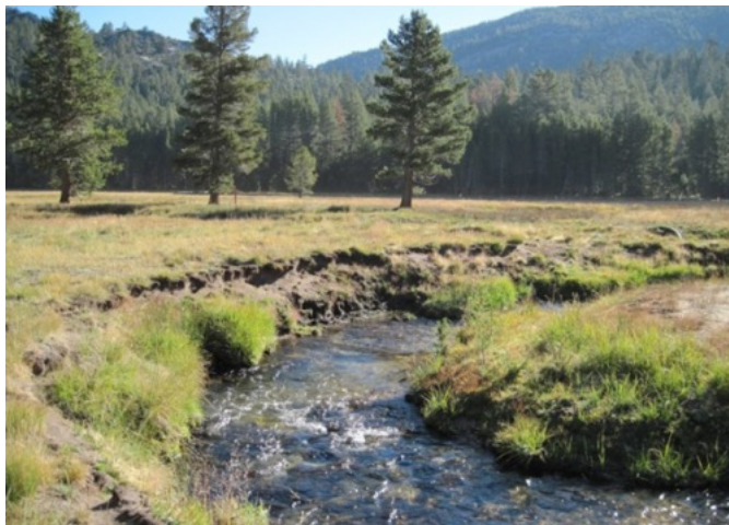
Cold Creek prior to restoration

Project Fact Sheet Data as of 11/16/2024