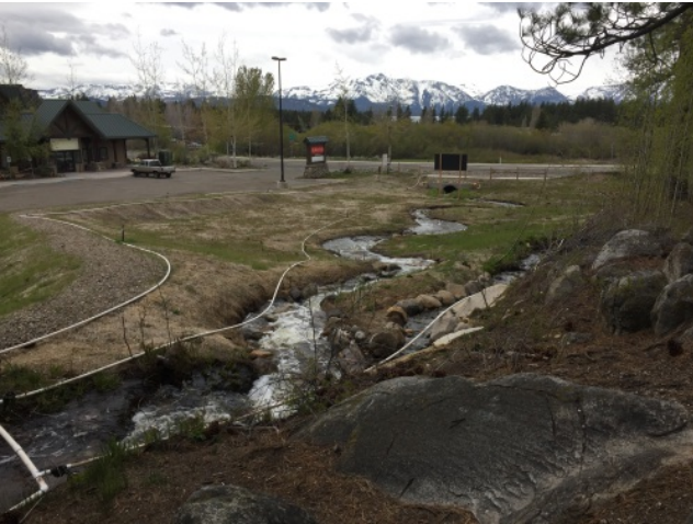
Burke Creek, May 2017