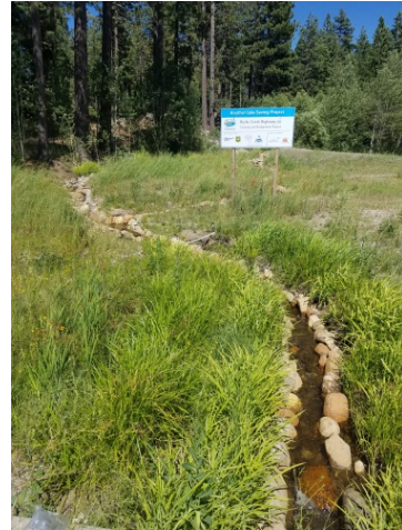
Burke Creek, July 2017

The project included the installation of a geomorphically correct crossing under U.S. Highway 50, removal of a portion of a parking lot for restoration to floodplain, spot treat headcuts upstream of Highway 50, and install conveyance improvements along the highway. In addition, Phase II of the project realigned Burke Creek directly downstream of Highway 50 and installed stormwater treatment infrastructure on U.S. Forest Service land. These improvements eliminated the discharge of untreated stormwater to Burke Creek thereby reducing the transport of fine sediment particles, phosphorus, and nitrogen to Lake Tahoe.