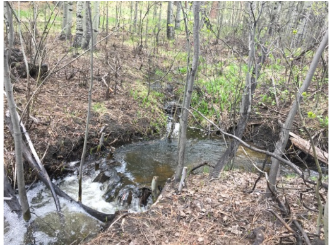
Upstream Willow Structure