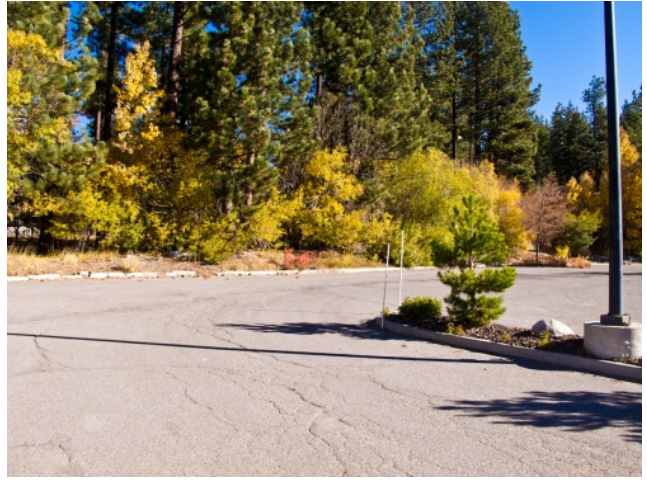
Burke Creek at Highway 50