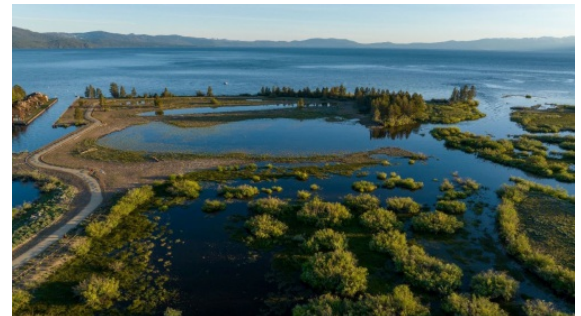
Upper Truckee River Marsh

Restore natural hydrologic processes and functions in the marsh by constructing pilot channels and spreading flow over the marsh. Increase area of SEZ and associated habitat types. Reduce sediment sources and increase sediment deposition and filtering particularly in high flow events. Construct improvements to support and direct public access. Restore portion of the Tahoe Keys Marina by constructing a bulkhead and restoring wet meadow/ marsh.