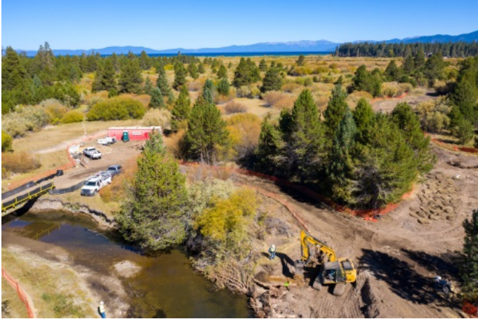
New pilot channel construction