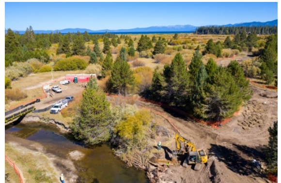
New pilot channel construction