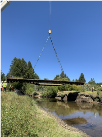
Temporary bridge crossing Upper Truckee River