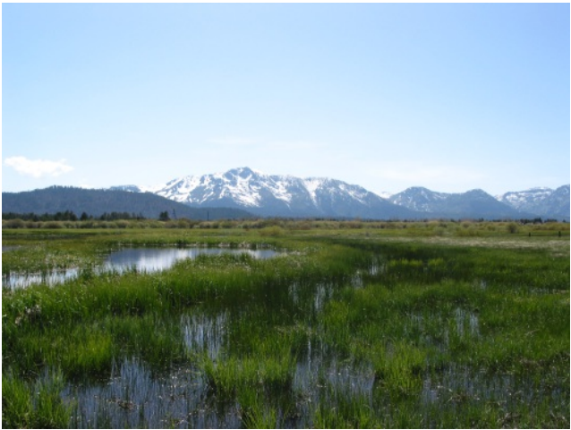
Upper Truckee Marsh