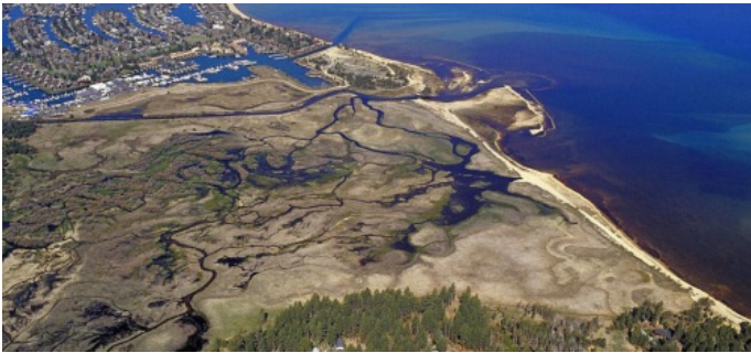
Upper Truckee Marsh aerial