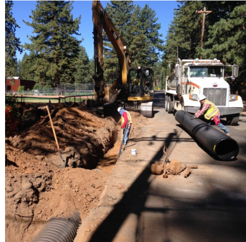
Construction completed during summer 2016