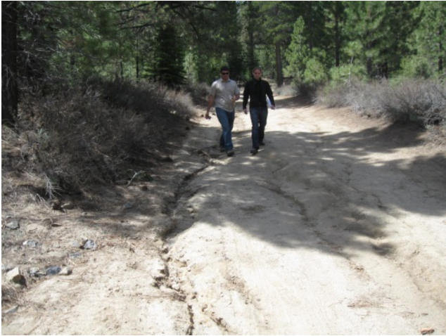
Management Road- Erosion