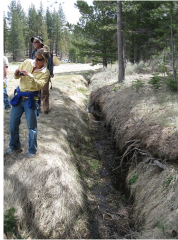
Incised Creek Channel