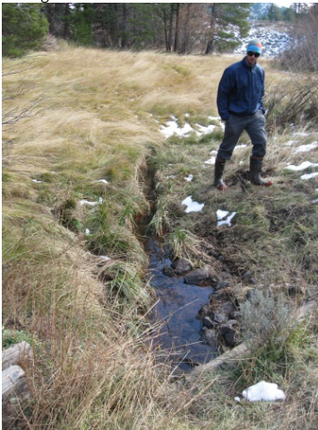
Stream bank erosion