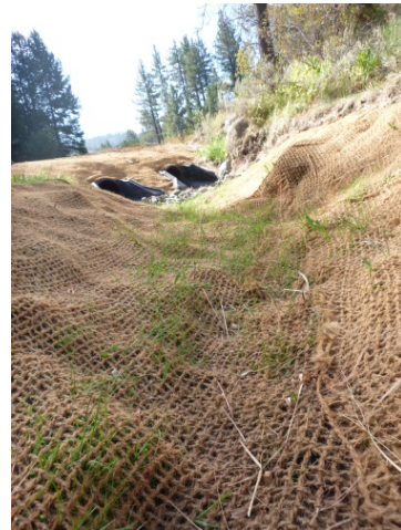
Channel restoration one month post-construction

The Nevada Tahoe Resource Team prioritized treatment areas for restoration. Restoration included realignment of the creek into the low point of the meadow and water quality improvements to the management road system within the project area.