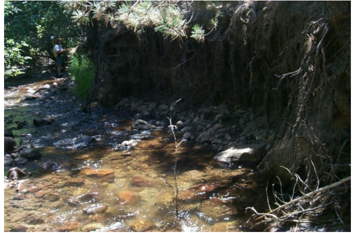
Massive erosion on Third Creek

Project Fact Sheet Data as of 05/13/2024