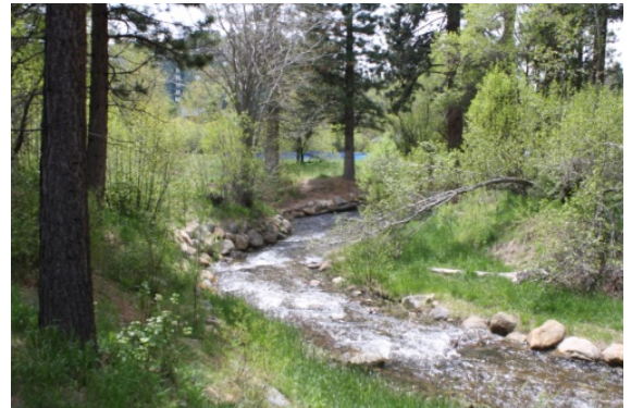
A restored Third Creek