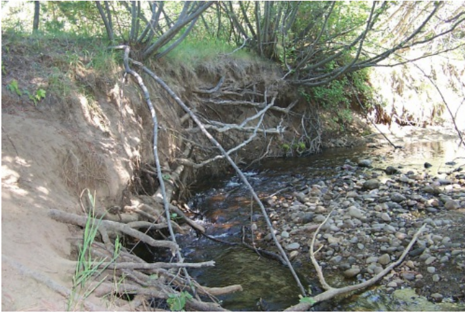
Massive erosion on Third Creek