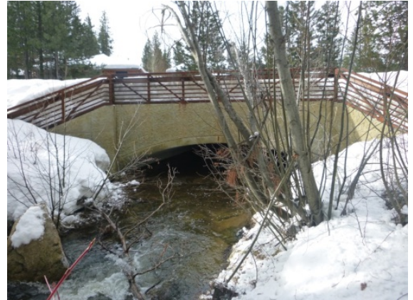
Fully passable, open bottom culvert on Incline Creek at Incline Way