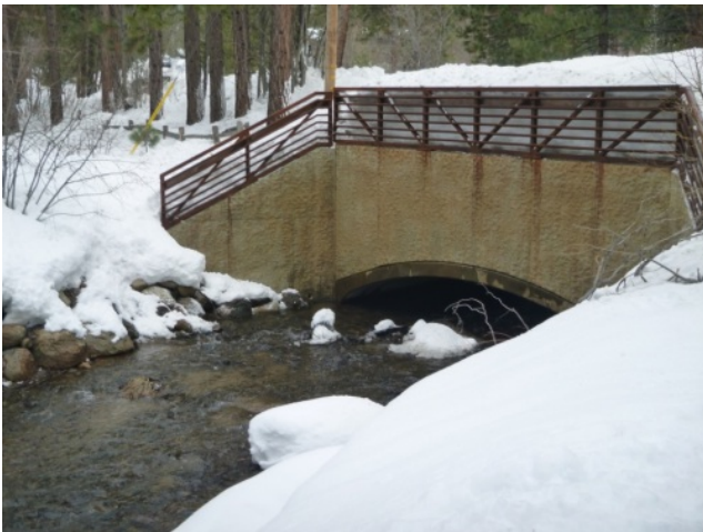
Fully passable, open bottom culvert on Third Creek at Incline Way

Project Fact Sheet Data as of 05/18/2024