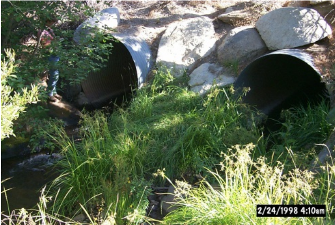
Impassable culvert on Incline Creek at Incline Way