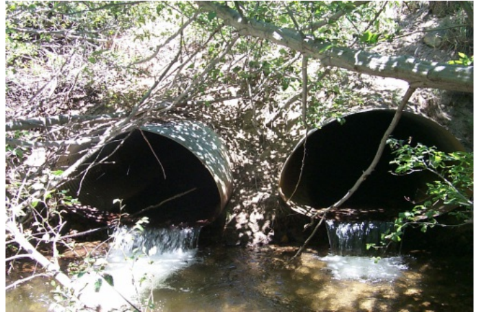
Impassable culvert on Third Creek at Incline Way