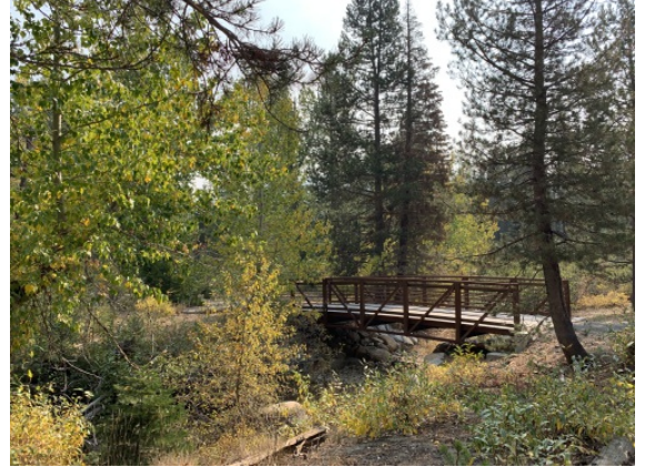
New bridge on path to Upper Truckee River

This project includes restoration and recreation improvements within the former Tahoe Pines Campground in Meyers. Project restores uplands, riparian habitat, floodplain, and riverbanks while providing public access improvements such as a new accessible trail, bridge, and parking lot, in an environmentally sustainable manner.