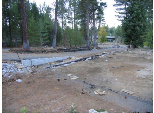
Disturbed floodplain in campsites area