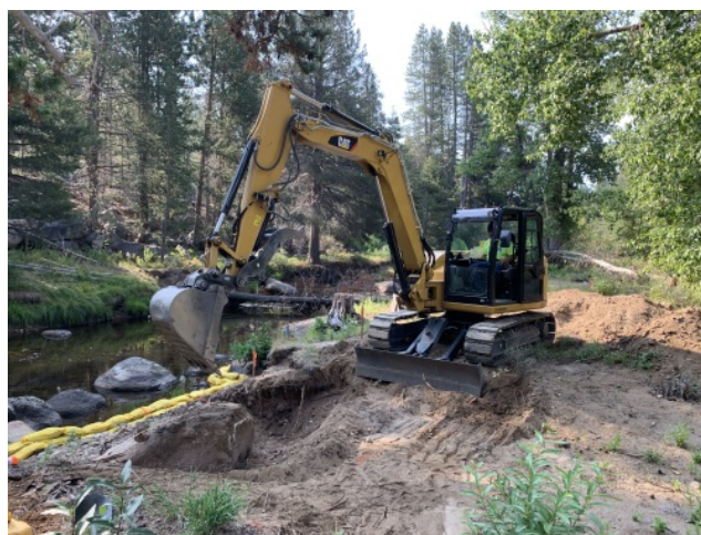
Swale inlet construction