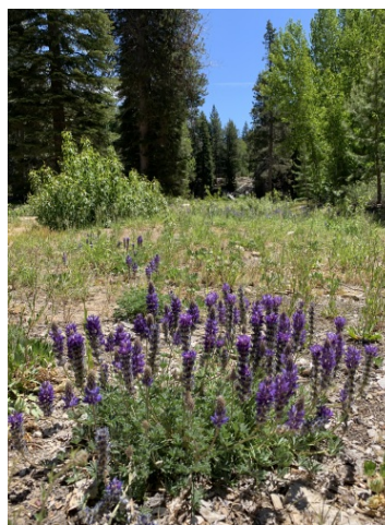
Restored Floodplain June 2021