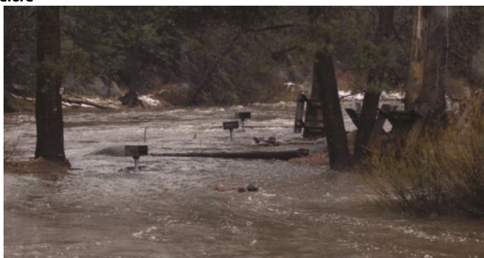
Flooding at Tahoe Pines Campground