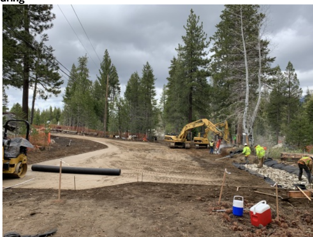
Parking lot construction