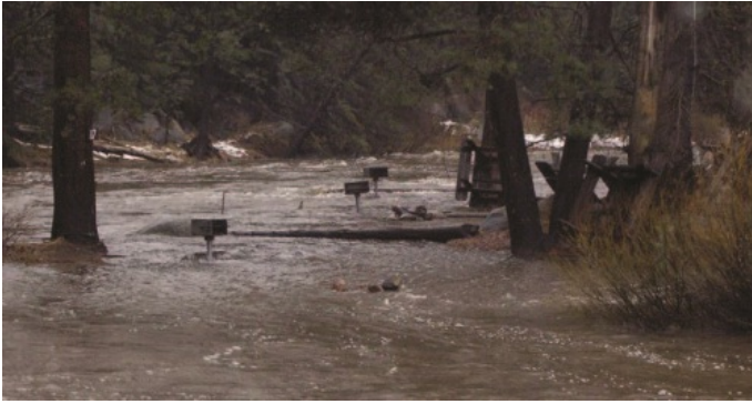
Flooding at Tahoe Pines Campground