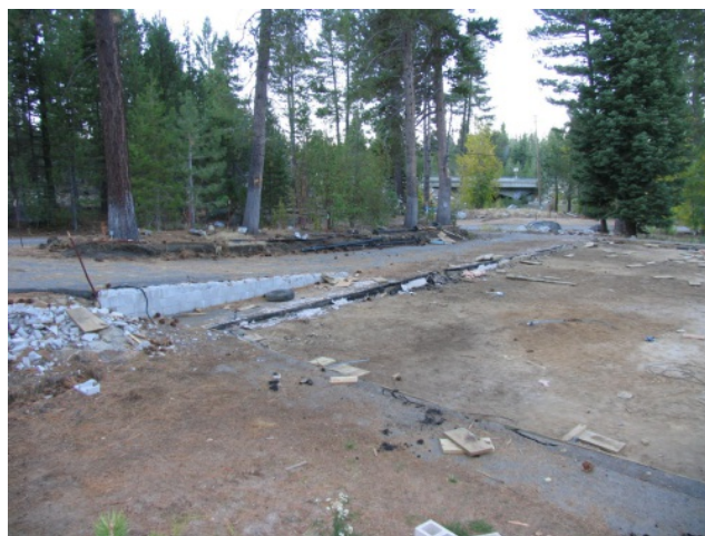
Disturbed floodplain in campsites area