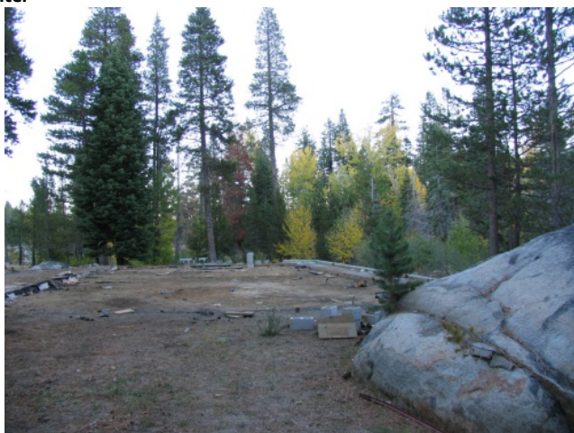
Site of demolished caretakers house