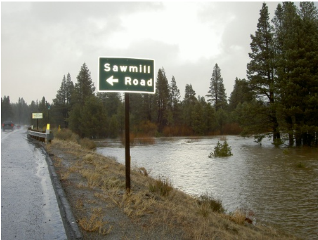
UTR Sunset Reach 6 December 2005 Flood US 50 & Sawmill Road Bridge