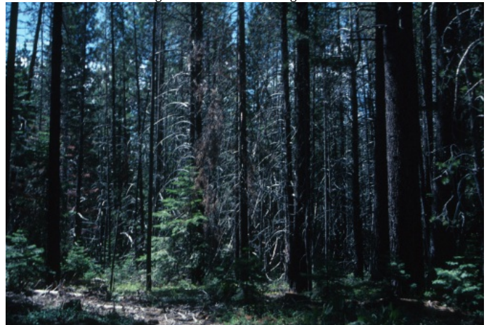
UTR Sunset Reach 6 Overstocked Lodgepole Thicket