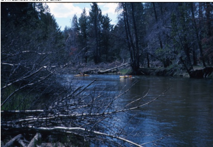
Rafting along UTR Reach 6