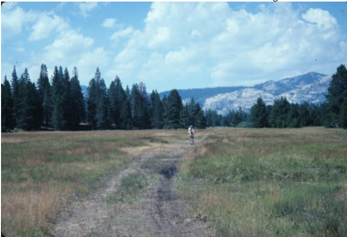
UTR Sunset Reach 6 Biker