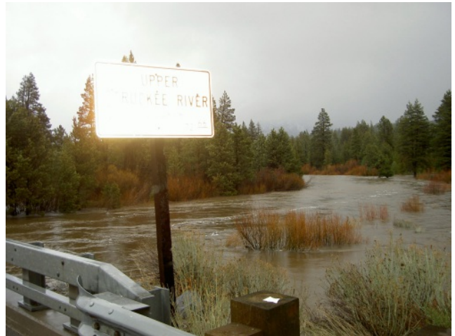
UTR Sunset Reach 6 Flooding at Sawmill & US 50 bridge 12-31-2005