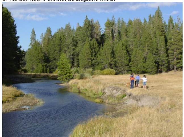
Visitors Along UTR Reach 6