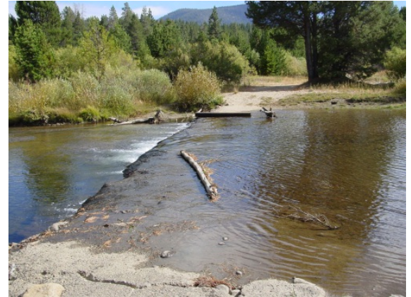
River Ford in UTR Reach 6