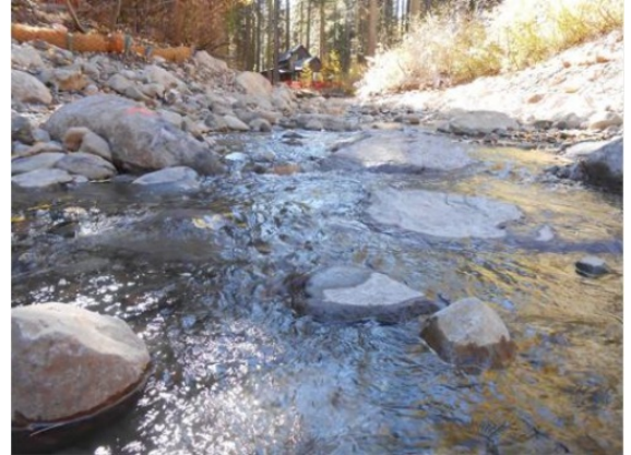
Lower Blackwood Creek Restored