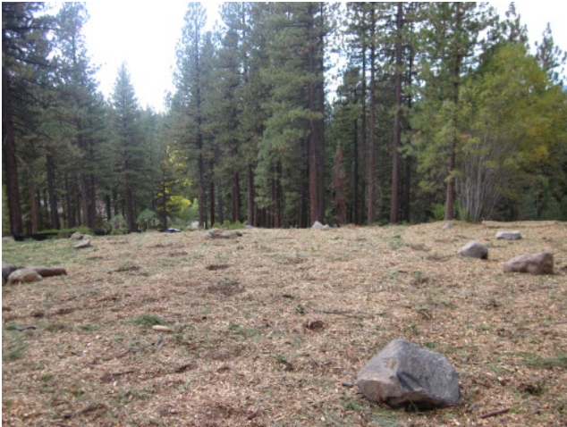
Water tank site-after restoration