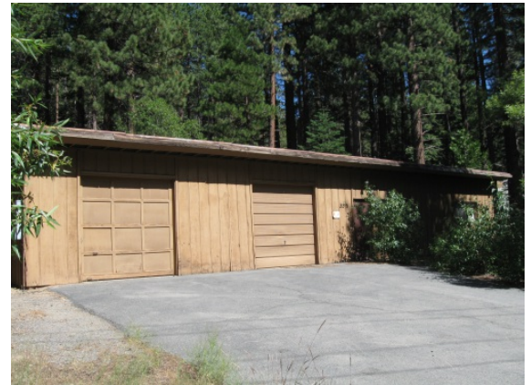
Maintenance building-before restoration