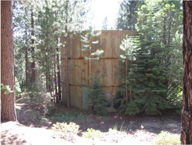
Water tank site-before restoration