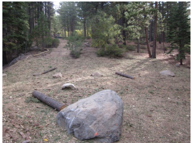
Maintenance building-after restoration

Project Fact Sheet Data as of 05/16/2024