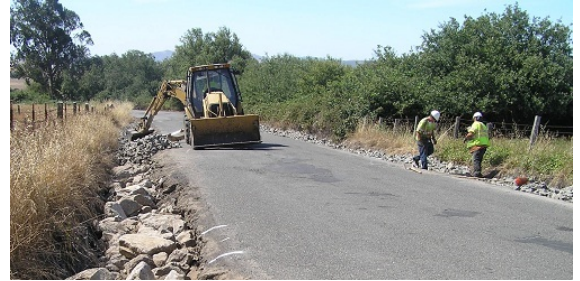
Drainage Swale Maintenance

Annual Stormwater Treatment Facilities Operations and Maintenance – Placer County. Placer County costs include engineering and management of the Lake Tahoe Clarity model reporting, IMP, SWQIC, PLRM and NPDES sediment load reduction mandate under Lahontan RWQCB.