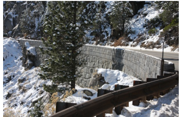
Reconstructed Echo Summit Wall

AT ECHO SUMMIT FROM ECHO SUMMIT ROAD TO 1.1 MILES WEST OF JOHNSON PASS ROAD