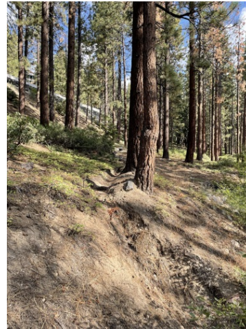
Erosion from NDOT outlet