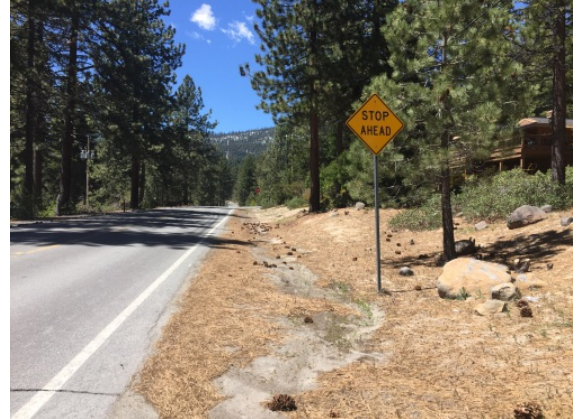
shallow Lakeshore Blvd ditch erodes and overflows during runoff events.