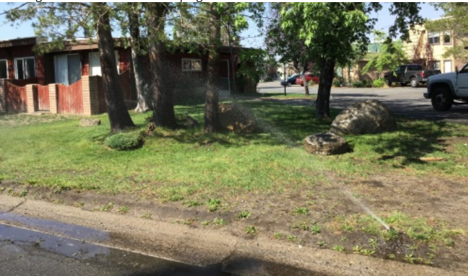
Tahoe Keys turf irrigation overspray