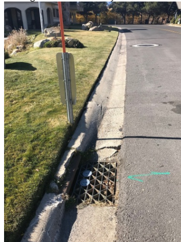
Turf upslope of Tahoe Keys storm drain