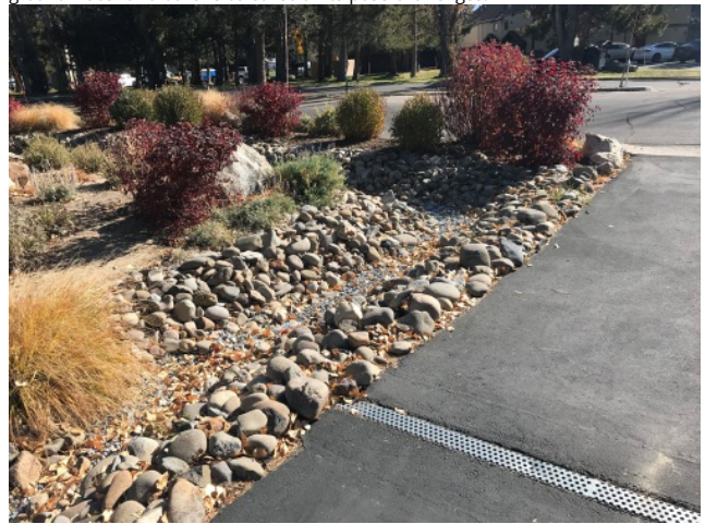
Existing TKPOA LID driveway BMP