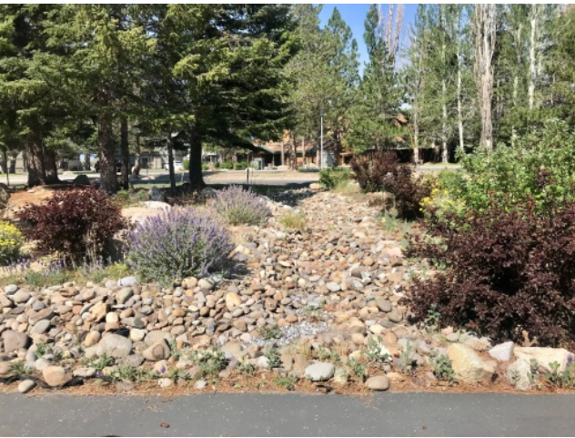
Existing LID BMPs. TKPOA landscaping and rock lined swale.