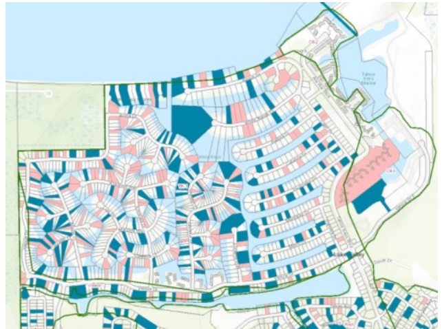
Many Tahoe Keys residential parcels have not met TRPA's BMP requirements. High ground water and other site constraints pose challenges.