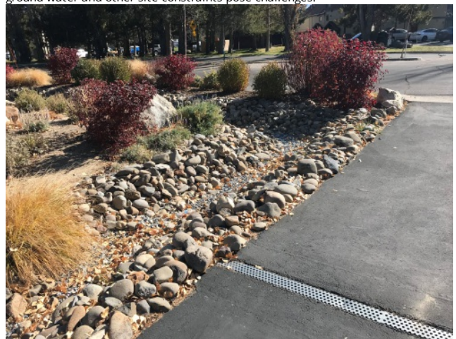
Existing TKPOA LID driveway BMP