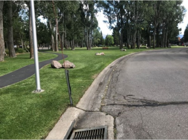
Possible location for Tactical Green Infrastructure (TGI) installation in the Tahoe Keys.