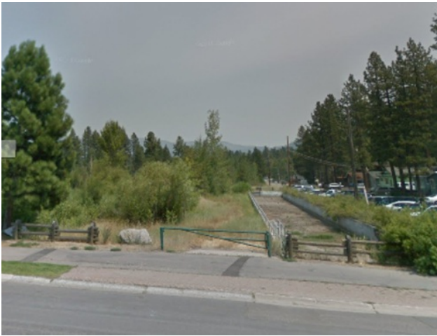
Green storm water infrastructure planning aims to improve capacity of existing storm water basin