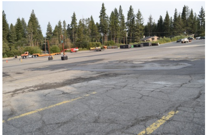
Ground water surfaces at Heavenly Cal Base Lodge parking lot in the upper watershed.