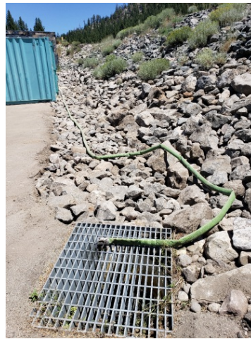
Groundwater intercepted and pumped at Heavenly California Base Lodge parking lot