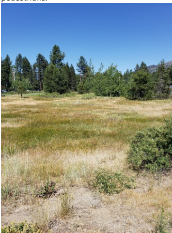
Opportunity to expand Osgood basin