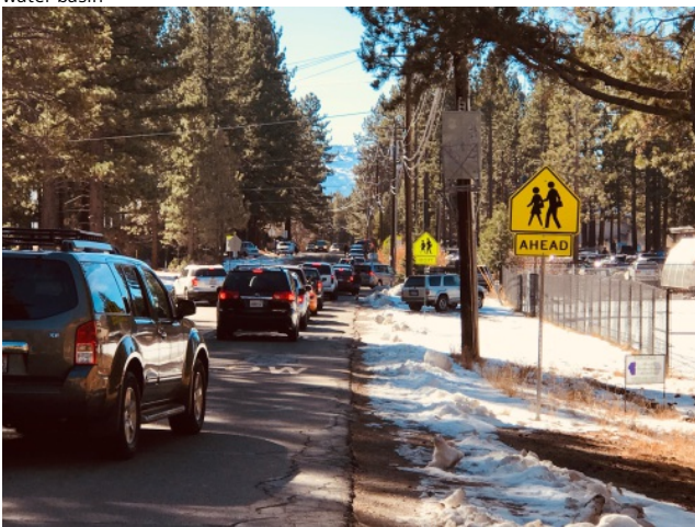
Traffic circulation along Spruce Avenue during Bijou Community School drop off/pick up. Off pavement parking and no sidewalk or safe route to school for bicycles and pedestrians.