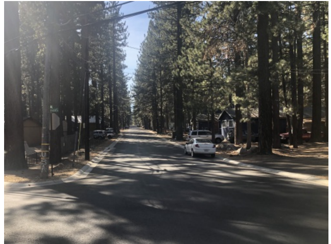
Helen Avenue - Looking west from Winnemucca Avenue intersection.

Project Fact Sheet Data as of 06/13/2025