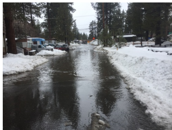
2nd Street flooding (3/21/2018)