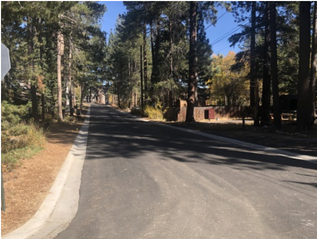
Silver Tip Avenue - Looking east from Winnemucca Avenue intersection.