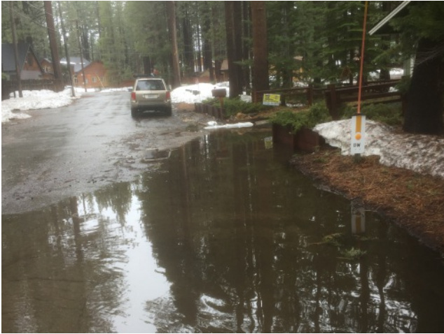
Silver Tip Avenue flooding (4/7/2018)