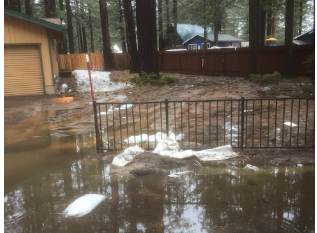
Flooding impacts to neighborhood and significant sediment source control issues