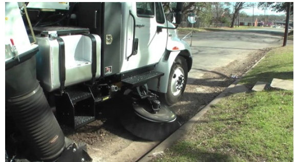
Regenerative Street Sweeper

KGID maintains 22 miles of roadway within the Lake Tahoe Basin. The purchase of a new high efficiency street sweeper will enhance KGID's ability to maintain its roadway system, which will ultimately help Douglas County reduce the flow of fine sediment to the lake and meet its required TMDL mandate. The County has registered KGID's road network within the Stormwater Tools and will receive TMDL credit for road operations, as long as the road score is at 3.0 or above. KGID will enter into a contract with Douglas County to sweep the roads according to an approved sweeping schedule. See https://stormwater.laketahoeinfo.org/RoadRegistration/Detail/3 for more information.