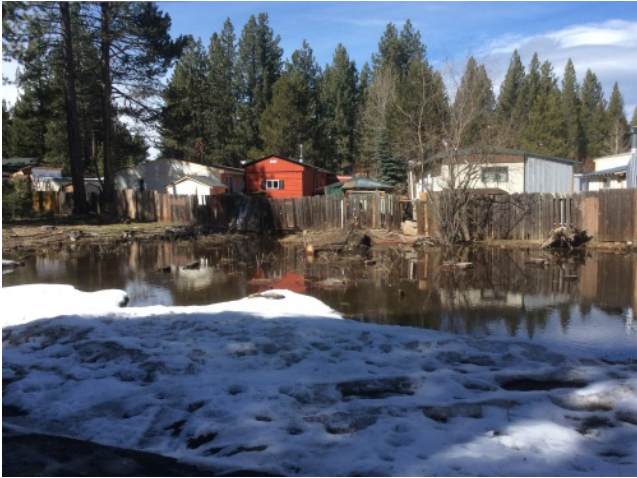
3/10/2016 - Flooding of Heavenly Valley Mobile Home Park