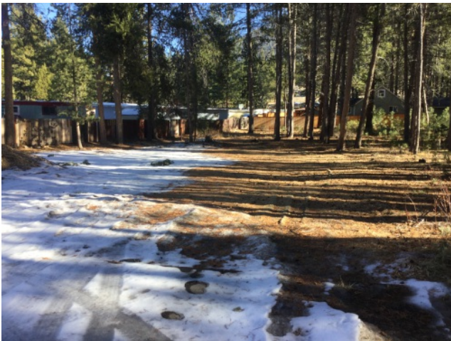
3755 Rockwood - After acquisition and demolition using CTC Prop. 1 funding