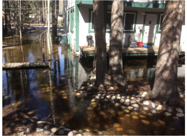
3/10/2016 - Flooding of 3747 Woodbine