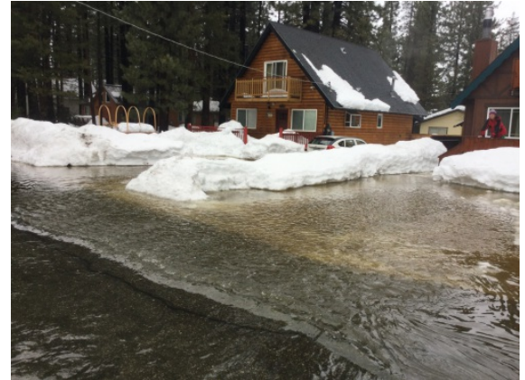
2/7/2017 Flooding on Shirley Ave (3593 Shirley)

The Upper Bijou Park Creek Restoration Project is a watershed-scale project seeking to address water quality & flooding issues in a phased approach to provide treatment for urban runoff in an approximately 850-acre watershed that discharges to Lake Tahoe via Ski Run Marina. The City completed Phase 1 in 2018 with the Knights Inn redevelopment, replacing the failing storm drain with new treatment basins and conveyance system. The City is currently finishing Phase 2 of the project (design), focused on the large upper watershed that includes 8 separate projects. Phase 3 (construction) begins with one of the projects, Rockwood to Blackwood, in May 2025. The other projects are currently unfunded.