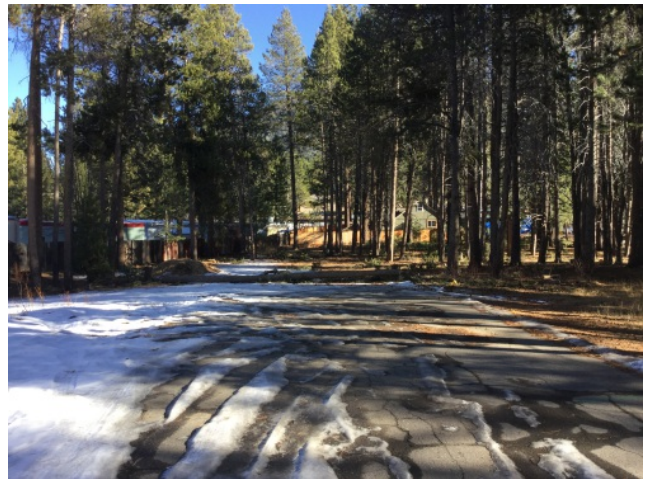
3755 Rockwood - After acquisition and demolition funded by CTC Prop. 1