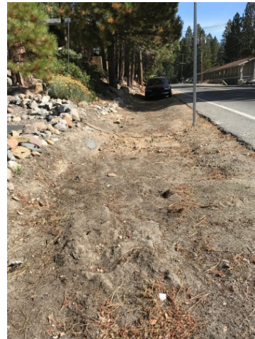
Erosion along roadways in Incline Village