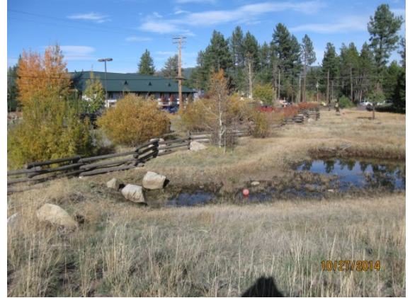
Existing Osgood SEZ area

Retrofit of the existing undersized Osgood basin to reduce fine sediment particles and nutrients in a high-priority, directly-connected catchment that discharges directly into the Ski Run Marina. Expansion of the basin to the east would require a higher berm, and proportionally larger footprint to overcome the challenges with the high groundwater table onsite. Alternative options may include a bypass to the Wildwood basins that would provide additional treatment once the the capacity of the currently undersized Osgood basin is exceeded. This project has been incorporated in the Upper Bijou Park Creek Project (EIP #01.01.01.0184).