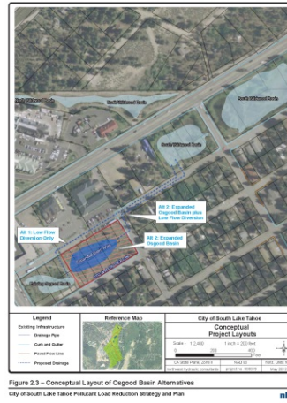
Osgood Expansion Conceptual Layout