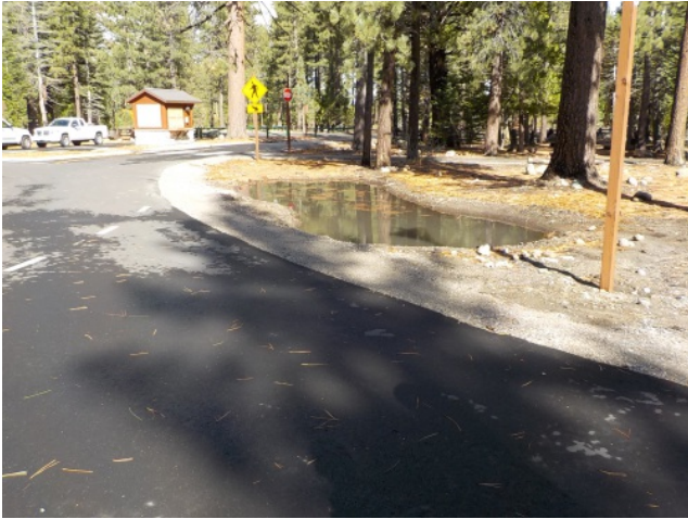
Camp Richardson Campground BMP microbasin