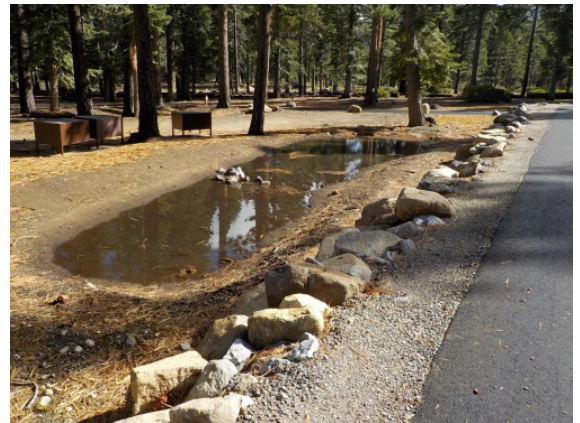
Camp Richardson Campground BMP microbasin

Retrofit and/or provide water quality BMP-compliant day use parking for resort guests and employees. Reconfigure and retrofit road and day use parking, including implementation of water quality BMPs. Retrofit Village area to provide improved circulation efficiency and safety and implement water quality protection BMPs. Reconfigure campground entrance and primary circulation within the southern campground area.