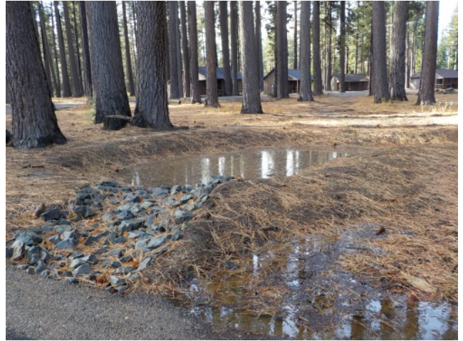
Camp Richardson Campground BMP microbasin

Project Fact Sheet Data as of 06/10/2026