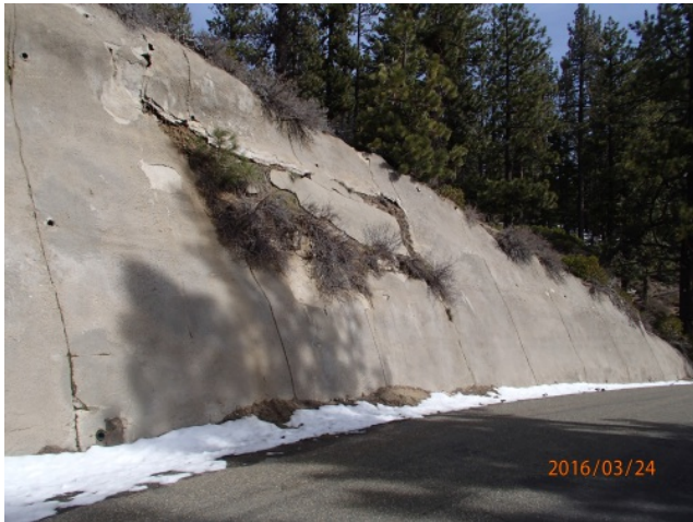
Ofylyng - Failing Slope