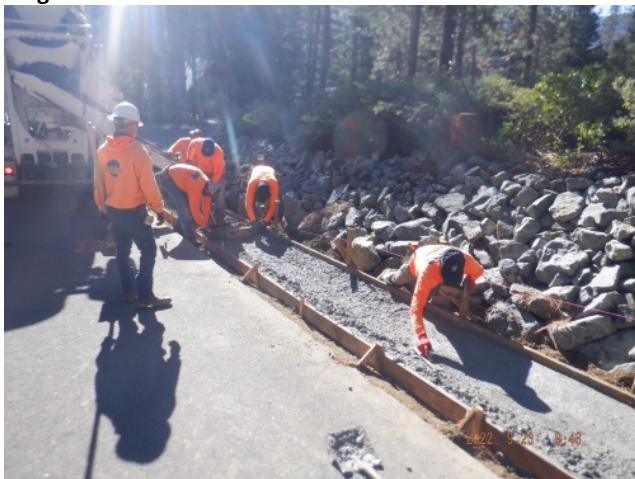
Curb pour on Tionontati (2022)