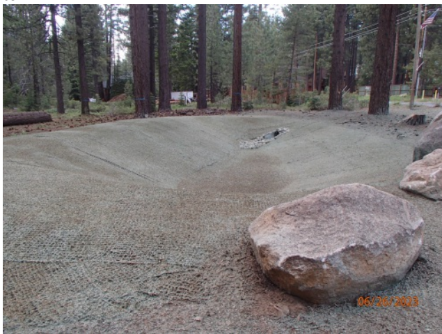
Infiltration basin adjacent to Garbage Dump Road and Pioneer Trail. New basin will capture stormwater runoff from storm drain system on Elks Club Drive.