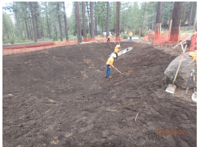
Construction of the basin at Garbage Dump Road and Elks Club Drive