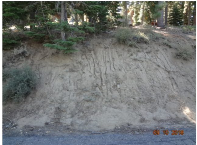
Eroding slopes tributary to existing drainage ways