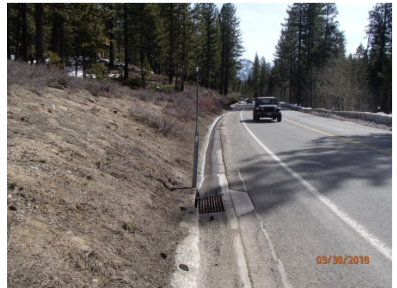
Comingled flows and traction abrasive wash-off that enter existing drainage inlet.