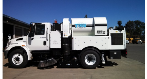
El Dorado County Tymco Sweeper

High-efficiency street sweepers are included in the Environmental Improvement Program under the improving air quality priority, although it is recognized that they have multiple threshold benefits.