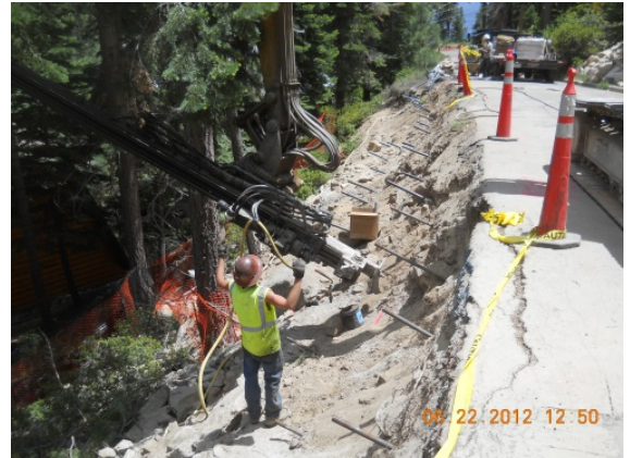
Installation of soil nails.