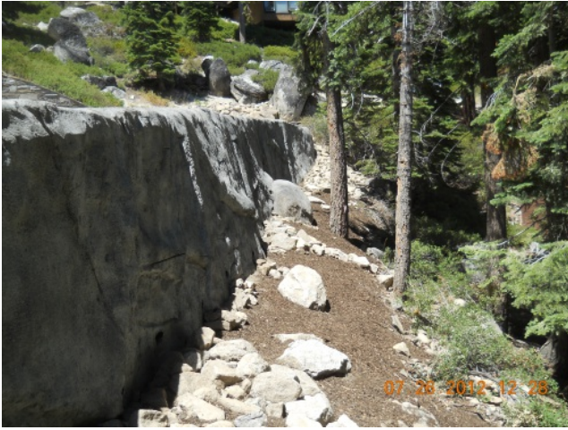
Completed slope repair.

Project Fact Sheet Data as of 05/12/2024