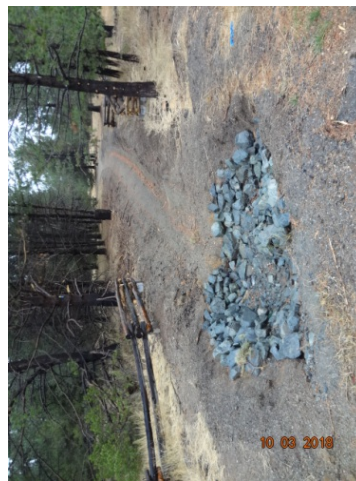
Phase 1/2 - New outlet channel to meadow area off of Boca Raton