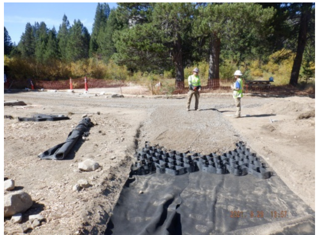
Phase 3 - Construction of DG geoweb path