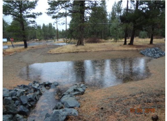
Phase 1/2 - Meadowvale Basin near corner of Boca Raton and Meadowvale Drive

The project, located in the Country Club Heights subdivision, is roughly bounded by Highway 50, the Upper Truckee River, and Crystal Air Drive. The main goal of this project is to reduce very fine/fine sediment from the County right-of-way from reaching the Upper Truckee River near Elks Club Drive to help achieve TMDL goals. Phases 1 & 2 focused on water quality (WQ) / Stream Environment Zone (SEZ) improvements throughout the subdivision. Phase 3 is focused on WQ / SEZ/ and User Access improvements surrounding the old "Elks Lodge" property between Elks Club Drive, Highway 50, and the Upper Truckee River.