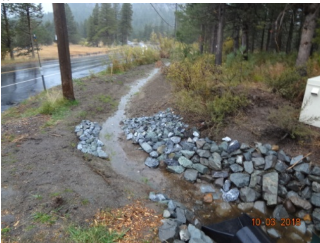
Phase 1/2 - New channel on east side of lower Elks Club Drive