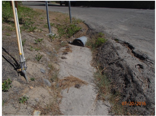
Phase 1/2 - Sediment Deposition - Elks Club and Thunderbird Court