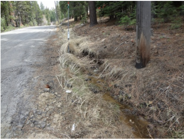
Phase 1/2 - Eroding channel