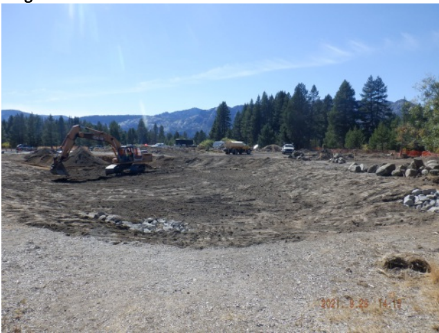
Phase 3 - Removal of non-native fill