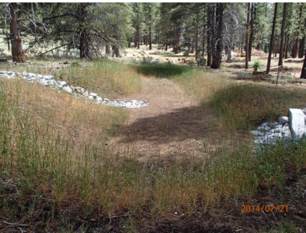
Lower Columbine Basin