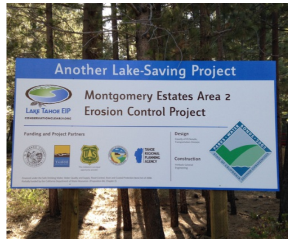
Montgomery Estates Area 2 Project Sign