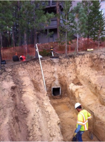
Installation of diversion pipe to Columbine Basins