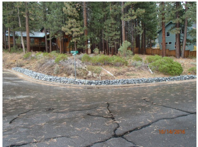
Rock Toe Protect - Corner of Marshall Trail and Wagon Trail Trail

Project Fact Sheet Data as of 05/19/2024