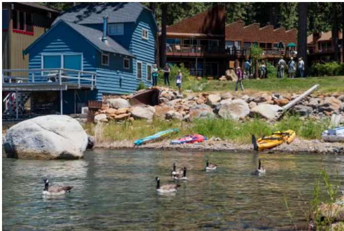
Lower Chipmunk Outfall