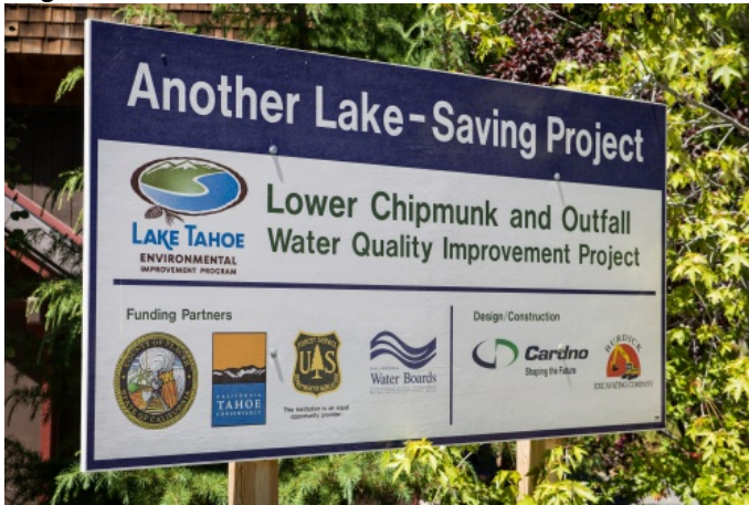
Project Sign for Lower Chipmunk