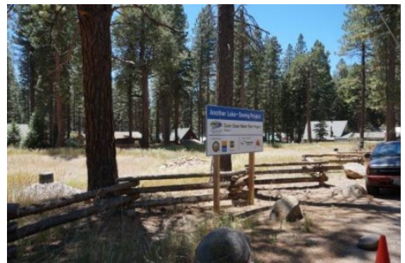
Basin for Coon Street Clean Water Pipe