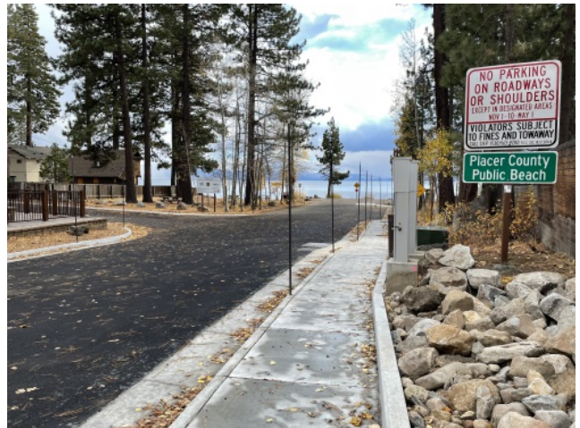
Lower Secline and Brockway Vista post construction

Project Fact Sheet Data as of 05/20/2024