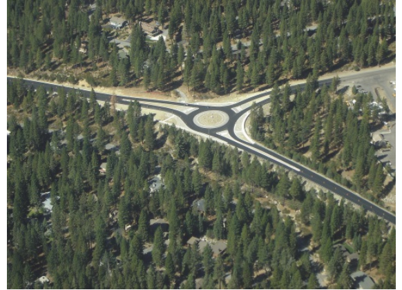
Aerial view of completed roundabout

A new roundabout is to be installed at the intersection of SR 28 and SR 431. The project design also includes stormwater treatment improvements as well as aesthetic features.