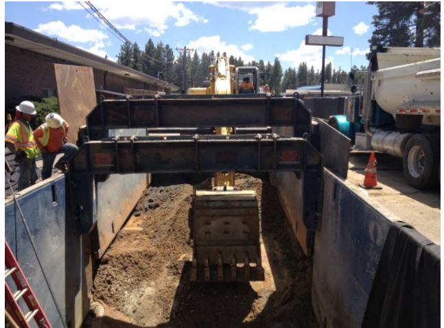
Trench Shoring 1