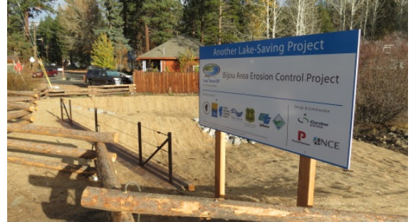
Bijou Project Sign near Fairway Drive

The Bijou Area Erosion Control Project - Phase 1 will treat stormwater runoff from the Bijou commercial area, adjacent to Lake Tahoe. The Bijou Commercial Core is 47 acres of nearly 100% impervious area, including US Highway 50, commercial properties, and City roads. Project construction includes: (1) Construction of a regional treatment system for Commercial Core runoff which will be pumped through an underground force main to infiltration basins in the upper watershed; and (2) Replacement of the Bijou Creek storm drain system that conveys storm water runoff from the 1,300-acre Bijou Creek watershed, through the Commercial Core, to Lake Tahoe.