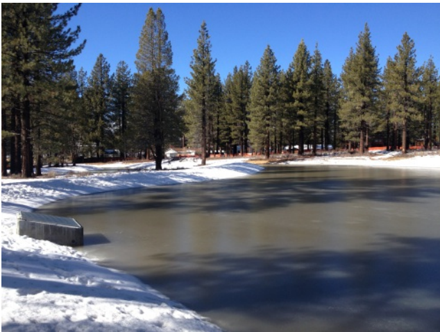
Large Infiltration Basin in Snow