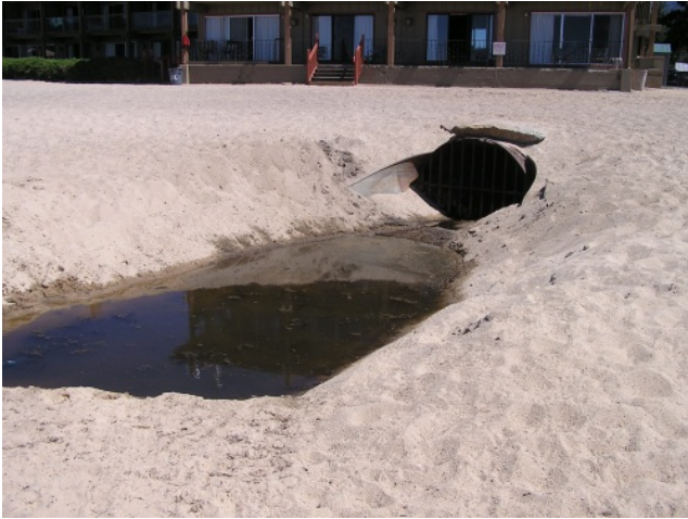
Bijou Outfall #1