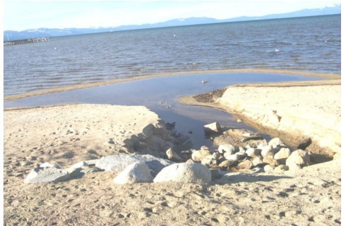
Bijou Creek Out to Lake