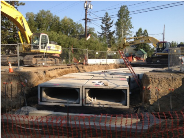
Double Box Culvert Installation